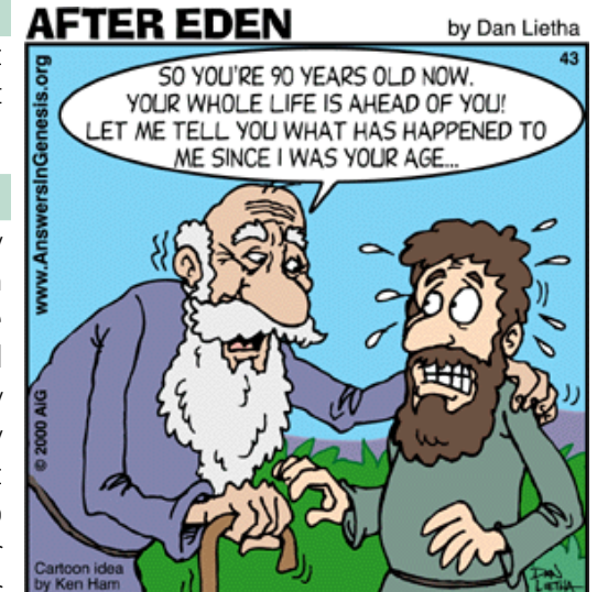
Methuselah's great grandson Shem knew this was going to take awhile.

This is a women's prayer ministry between two women from our church family. Ladies who wish to participate will complete a questionnaire and return it to the Ladies' Ministry Team. The Team will allocate each lady another lady who will be her Secret Prayer Sister whom she needs to uphold in prayer. You will become her secret prayer partner and encourager for a 6-month period - then there will be a "reveal party" where prayer sisters are revealed. Your Secret Prayer Sister